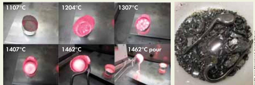
(left) Melt series based on chemistry of melted amphibolite composition from the Broborg site. Melting in atmosphere and without the use of bellows required heating the material to temperatures >1,400°C, which is not likely to be reached in ancient times. (right) Final glass produced from the melting study.

the aid of bellows. Other studies have found that amphibolite collected from the site could be melted only with the help of a forced draft and a furnace hearth covered with turf. 7 These results suggest that to create vitrified portions of the wall, ancient people most likely had to control redox condition and water content of the melt—a technology they most likely developed based on their experiences with iron smelting. Understanding how these melts were made could inform their chemistry, which is invaluable in determination of the long-term durability of Broborg glasses. ■