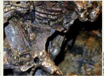
(left) Jamie Weaver at the Broborg hillfort near Uppsala, Sweden, where remains of a vitrified wall are protruding from the snow. (right) Close-up of a molten section from a hillfort, showing impressions of the charcoal used to vitrify the materials, despite ~1,000 years of weathering.

led researchers at Washington State University and Pacific Northwest National Laboratory to dig into the geology of this region of Sweden. The amphibolite used at the site is metamorphic doleritic rock formed at high water pressure and contains mainly hornblende and feldspars. Studies of the amphibolite left at the site have uncovered evidence of a wide range of localized melting and moisture evolution, from slight heating to complete liquefaction. WSU scientists have found that temperatures >1,400°C are needed to create a molten material if the melting is completed in air without