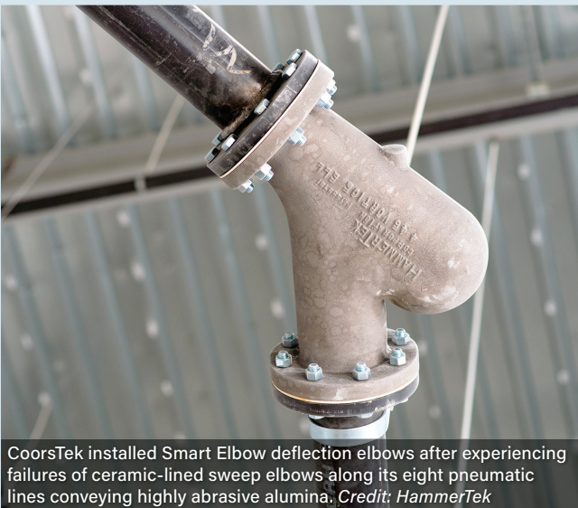
CoorsTek installed Smart Elbow deflection elbows after experiencing failures of ceramic-lined sweep elbows along its eight pneumatic lines conveying highly abrasive alumina.

"I don't think it was communicated clearly how abrasive our materials are," Harm says. "They very quickly started poking holes in the elbows."