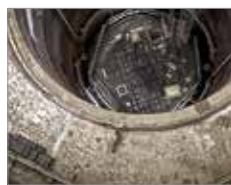
Nuclear & Environmental Technology