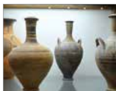
Art, Archaeology & Conservation Science