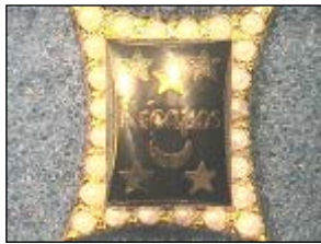
Crown Pearl Badge $160.30 in 10K gold, $93.85 in gold clad