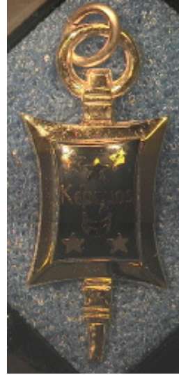
Key $120.20 in 10K gold, $37.80 in gold clad