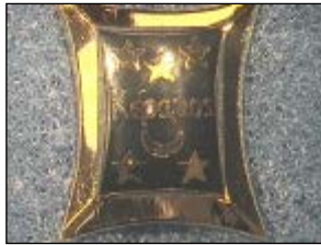
Plain Badge $91.20 in 10K gold, $23.75 in gold clad

Engraving is available (initials, chapter, letters, date) for all items at an additional cost of $4.00