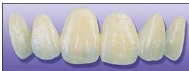
Fig. 2 Glass-ceramic teeth.

The most important system commercially is the \text{Li}_2\text{O}-\text{Al}_2\text{O}_3-\text{SiO}_2 (LAS) system with additional components, such as \text{CaO} , \text{MgO} , \text{ZnO} , \text{BaO} , \text{P}_2\text{O}_5 , \text{Na}_2\text{O} and \text{K}_2\text{O} . Fining agents include \text{As}_2\text{O}_5 and \text{SnO}_2 . \text{ZrO}_2 in combinations