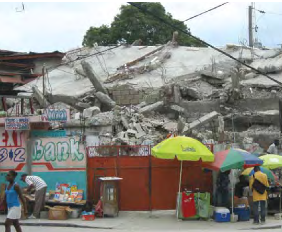
Reconstruction offers Haiti an opportunity to rebuild the nation to safer, stronger standards.