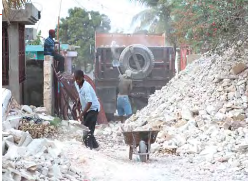
Photo from a May 2010 visit to Port-au-Prince, Haiti, shows earthquake-damaged and collapsed buildings surrounded by piles of concrete rubble and mounds of debris.

To determine if this approach is feasible, we recently undertook a preliminary study to assess whether new good-quality concrete construction could be produced using debris as aggregate. Our goal was to obtain Haitian fine aggregates and Haitian-produced concrete, which we would crush and process using simple methods duplicating those typically employed in construction in Haiti. Finally, from these materials, we