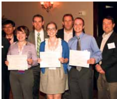
Student poster award winners with Electronics Division leaders.