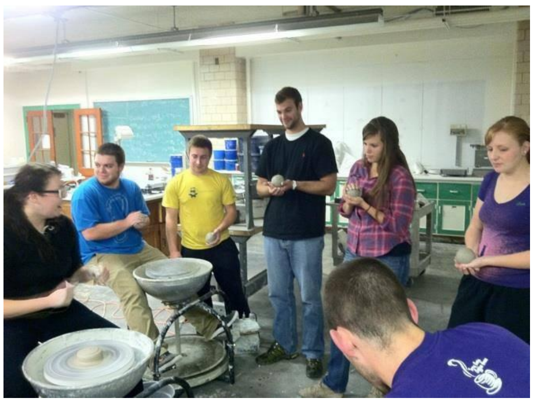
Keramos members at a play with clay event