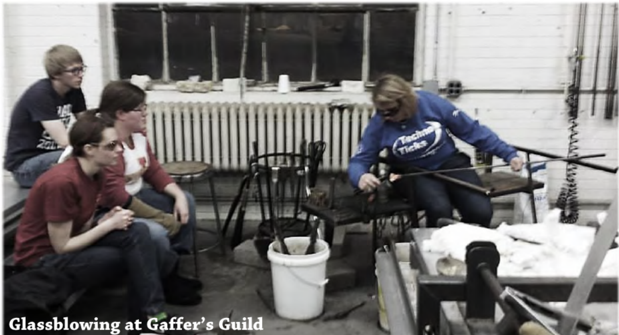
Glassblowing at Gaffer's Guild

Through glass blowing events with the ISU Gaffer's Guild, we have strengthened Keramos' ties to other ceramics-centered organizations on campus. We hope to continue this trend, organizing more events with Gaffer's Guild and putting on joint events with Material Advantage - another campus organization for materials scientists. By redoubling our efforts of collaboration, we will both broaden the experience of our current members and improve our ability to recruit new members.