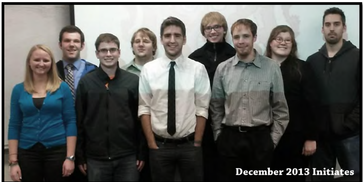
December 2013 Initiates