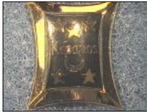
Plain Badge $91.20 in 10K gold, $23.75 in gold clad

Engraving is available (initials, chapter, letters, date) for all items at an additional cost of $4.00