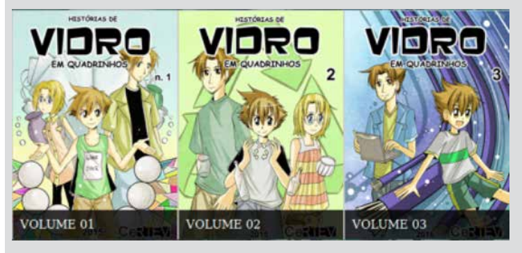
Covers of the first three volumes of Vidro, a series of comic books about glass.

During these first four years, we have consolidated a coherent collaborative research program dealing with fundamental research and development of new materials with technologically interesting properties, covering the full range of timely and potential application areas for glasses and glass-ceramics. Collaboration with partners in industry and extensive promotion of CeRTEV's research findings into marketable products is an integral part of our agenda, which also includes develop-