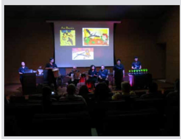
The experimental "glass orchestra" of the Federal University of São Carlos in Brazil playing an opening show in December 2016.

demonstrations of properties and curiosities associated with vitreous materials, including light transmission by optical fiber, glass coloring by doping, acoustic properties, and photosensitive and flexible glasses. The interactive exhibition was presented at numerous major cultural events, reaching out to an audience of ~30,000 attendees.