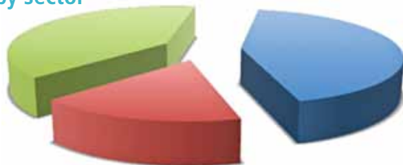
EXHIBIT DAYS AND HOURS