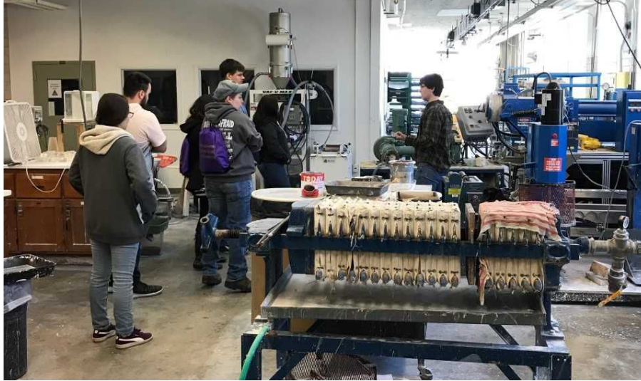
CABOCES event, showing high school students ceramic processing equipment

This year we helped out with demos for materials science and specifically ceramics at Alfred's women in engineering day. We also volunteered to help with CABOCES outreach events. The CABOCES events brought in high school students from the area onto campus to learn about the different kinds of engineering we have at Alfred University.