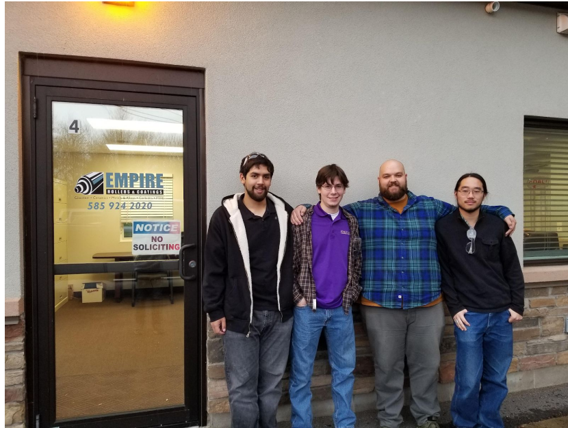
Plant tour, In front of Empire Treater Rolls