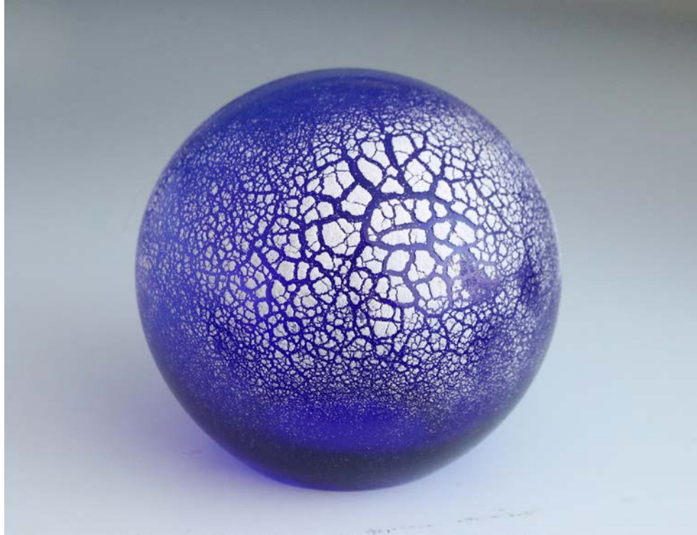
2017's Artistic Creativity Award, "Blue Planet" by Laura Aalto-Setälä, juxtaposes blue glass globe with ice floe, making it look like ice is melting (indicating global warming)