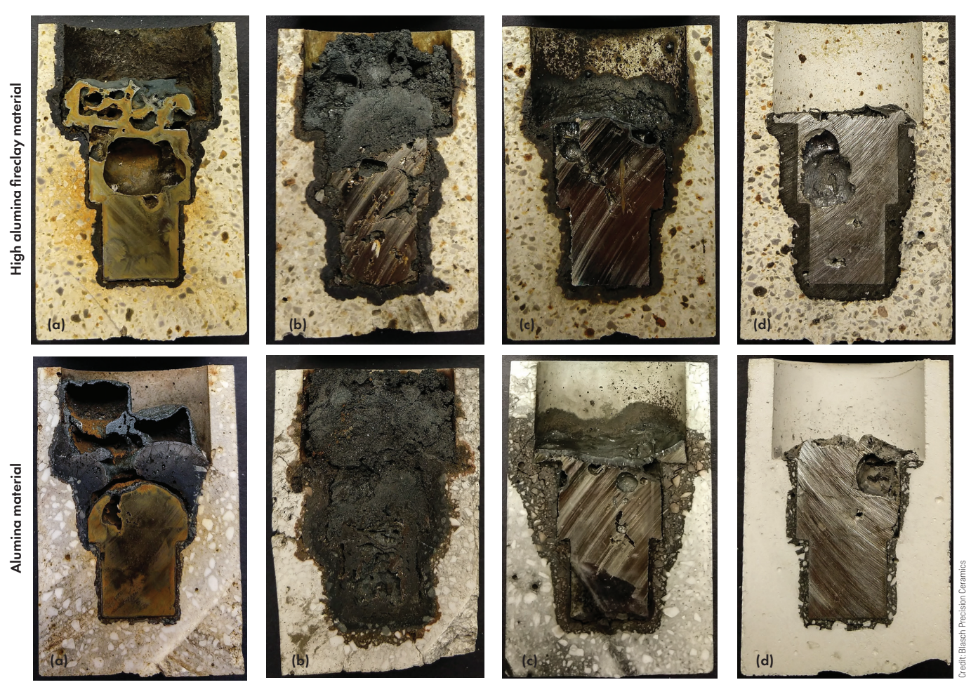
Figure 1. Corrosion testing of high alumina fireclay and alumina crucibles containing (a) cast iron, (b) 304 stainless steel, (c) 400 nickel, and (d) 6061 aluminum.

for both traditional (e.g., cast iron and steel) and advanced (e.g., lithium alloy) molten metal processing are backing out of sales for the more expensive ceramic products and instead are sourcing lower-performing but less costly products to remain within budgets.