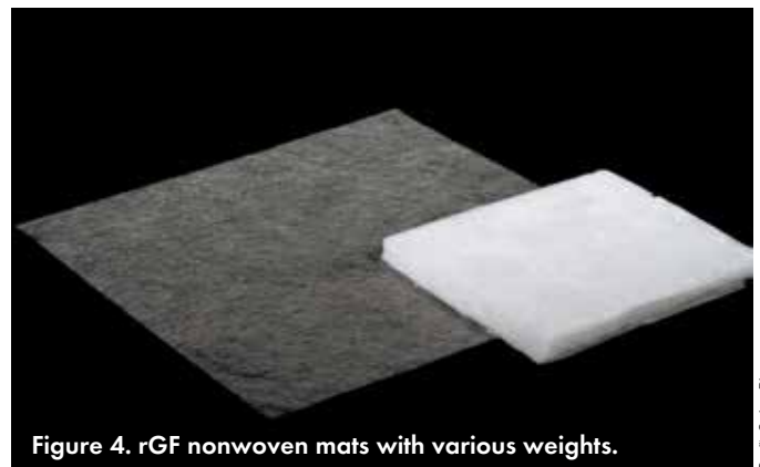
Figure 4. rGF nonwoven mats with various weights.