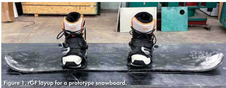
Figure 1. rGF layout for a prototype snowboard.

The amount of polymer crude oil is a happy surprise, as the process initially focused on glass fiber recovery. Initial analysis demonstrated that the oil can be fractionated off the stack for next life cycle petrochemical production or aviation and marine fuel.