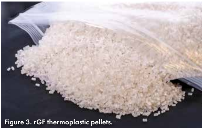
Figure 3. rGF thermoplastic pellets.