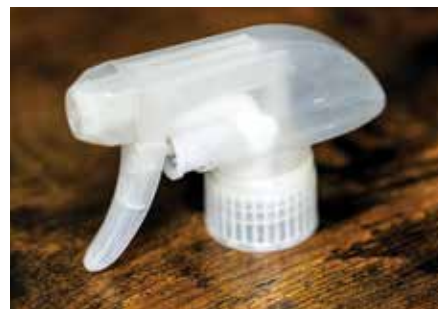
Figure 2. rGF thermoplastic pellets in injection molded commercial sprayer head.

Bowie Benson, co-founder and CEO of Carbon Rivers, has been involved in the process from the beginning. He says, "Doing the impossible, or just plain difficult, is just another day at Carbon Rivers, which is leading the industry in creating closed-loop, full-scope composite waste material solutions. Still, as great as