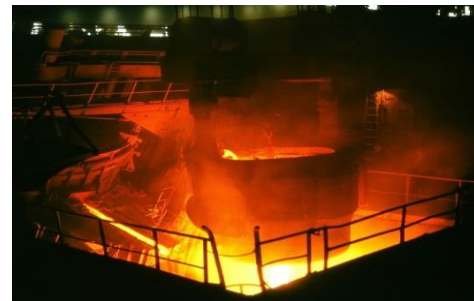
Figure 2. Steelmaking – refractory materials are used in the crucible.