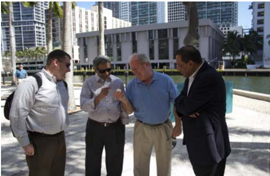
Board of Directors visited; that was great