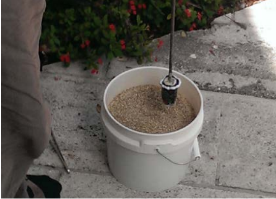
Annealing in a pot of vermiculite; that's all.