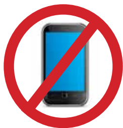
Cell phones silent

During oral sessions conducted during Society meetings, unauthorized photography, videotaping, and audio recording is strictly prohibited for two reasons: