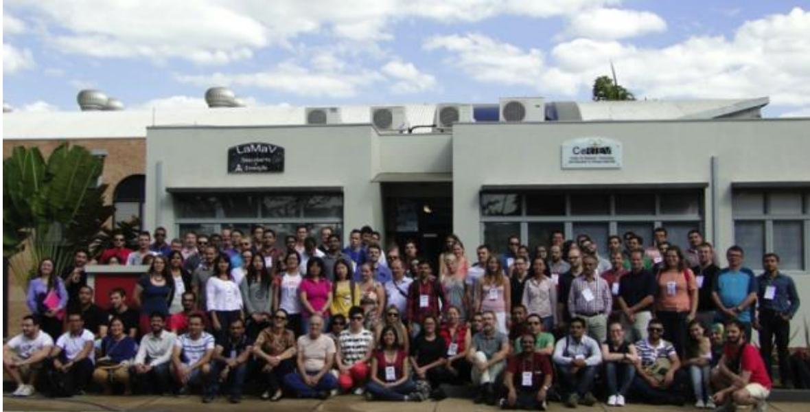
Vitreous Materials Lab (LaMaV) at Federal University of São Carlos ( lamav.weebly.com ). Instructors and attendees of the First School (2015) with 70 international students and 30 Brazilians.