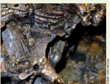
(left) Jamie Weaver at the Broborg hillfort near Uppsala, Sweden, where remains of a vitrified wall are protruding from the snow. (right) Close-up of a molten section from a hillfort, showing impressions of the charcoal used to vitrify the materials, despite ~1,000 years of weathering.

led researchers at Washington State University and Pacific Northwest National Laboratory to dig into the geology of this region of Sweden. The amphibolite used at the site is metamorphic doleritic rock formed at high water pressure and contains mainly hornblende and feldspars. Studies of the amphibolite left at the site have uncovered evidence of a wide range of localized melting and moisture evolution, from slight heating to complete liquefaction. WSU scientists have found that temperatures >1,400°C are needed to create a molten material if the melting is completed in air without