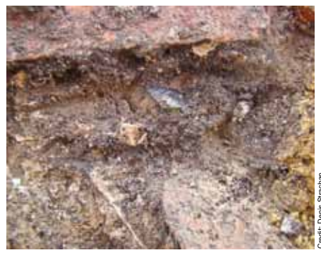
Figure 4. Glass collected in-situ with contacted soil at the Aquileia site in Italy. Aquileia was a major glass-producing center in Roman times.

alteration condition in which silica-rich materials are altered in the presence of metallic iron. This situation is similar to what may happen to nuclear waste glass as it ages in stainless-steel containers.