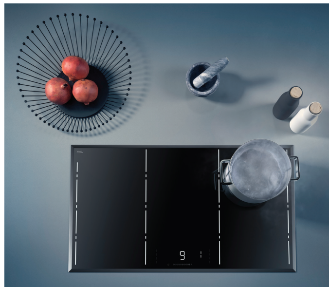
Figure 6. The Schott CERAN brand of glass-ceramic cooktops has been named Brand of the Century four times by the ZEIT publishing group, in 2013, 2016, 2019, and 2022.

Both glass and ceramics find use in this sector for their unique functional and aesthetic properties (see the article