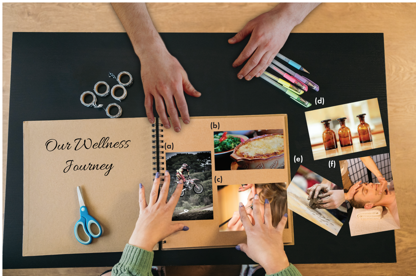
Figure 1. Glass and ceramic materials have many applications in the health and wellness industry.