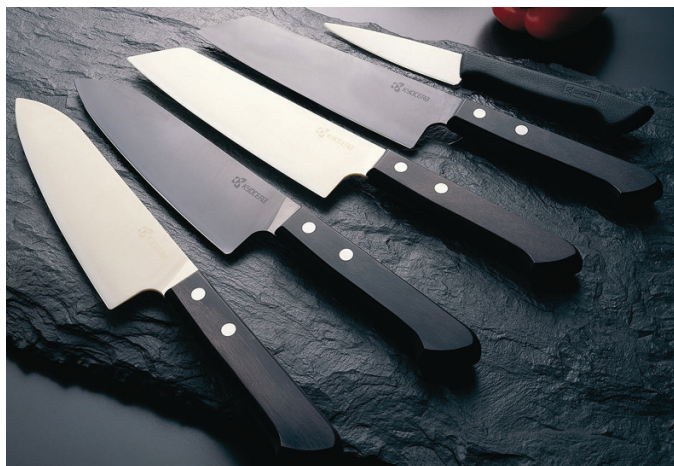
Figure 5. A sampling of the ceramic kitchen knives produced by Kyocera.

Corning pioneered glass-ceramic bakeware with the CorningWare product line following S. Donald Stookey's discovery of recrystallization in the lithium silicate glass system in the 1950s. Today, glass-ceramics also find use as flat cooktops, which are used to transfer heat from radiant or induction burners. Glass-ceramic cooktops are gaining increasing market share as more consumers convert from gas stoves to avoid relying on fossil fuels. Schott (Mainz, Germany) is a major player in this area (Figure 6).